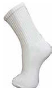
Sports Socks from £3