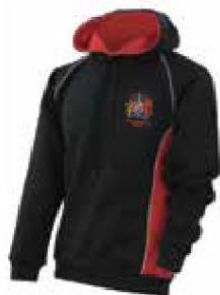
KEHWGA Hoody from £16