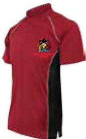
KEHWGA PE Top from £13