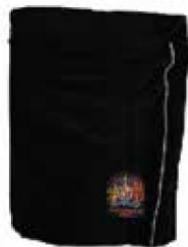
KEHWGA Skort from £10